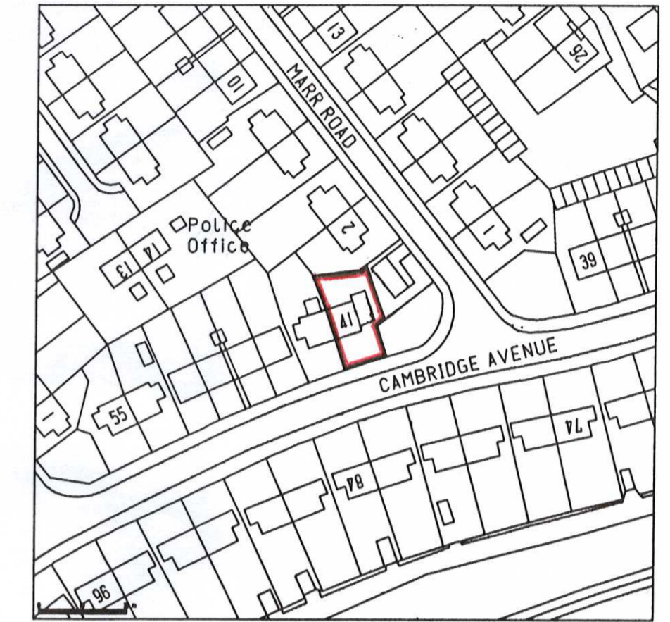
Site Location Plan Scale 1:1250